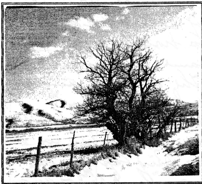
The Cottonwood Trees where Merlin camped when they arrived.