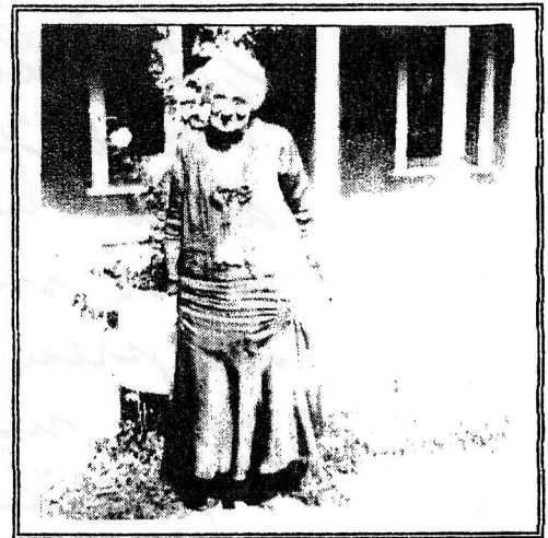
Me - when I was old.