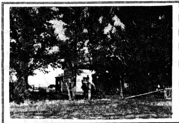
My home in Laketown built in my later years.