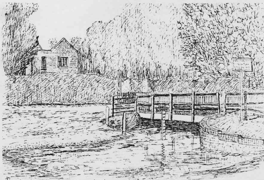
Brockenhurst, the watersplash.